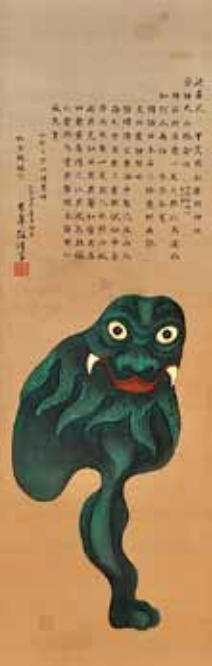
"Yamanashi-gun Yamanashi Oka-jinja Shrine Kinokami no Zu" Yamanashi Prefectural Museum

Yamanashi Oka-jinja Shrine was established on the Mimuroyama mountainside by imperial order more than 2,000 years ago, when the area was hit by a plague and frequent disasters. Later, it was moved to the foot of the mountain after removing the Yamanashi, or mountain pear trees; hence, the name Yamanashi Oka-jinja Shrine. It is said that the name of the prefecture is derived from that shrine (there are numerous stories about the origin of Yamanashi Prefecture). A strange image of a deity, Kinokami, is enshrined at this shrine, which is the only place in Japan where this deity's likeness can be found. It has a cow-like body, with no horns, is colored green and has one leg. It is said that Kinokami possesses the power to protect people against being struck by lightning and to ward off evil spirits.